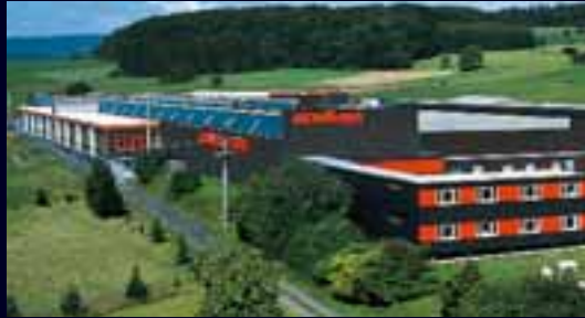
Main Factory Neunkirchen

Günther-Tore GmbH Metallwerk Industriegebiet D-56479 Neunkirchen Tel. +49 (0) 64 36/601-0 Fax +49 (0) 64 36/601-130 www.guenther-tore.de info@guenther-tore.de