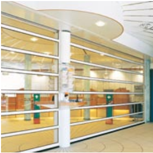
Mobile partition walls